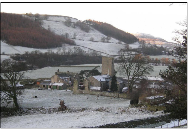
A wintry picture of the Priory with Harkerside in the distance.

It hardly seems a year since we last wrote to you, yet here we are again with an update of all the happenings in and around the Priory from the last year. It's been a busy year with residential and day bookings, some new faces and plenty of old ones. So what's new, what's been going on and what can we look forward to in 2010? Read on and find out more.