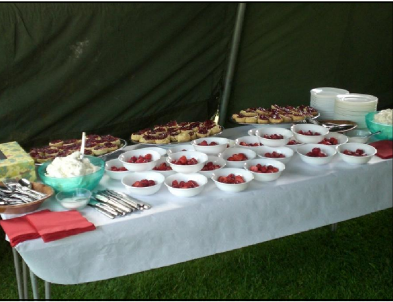
A delicious spread of strawberries, scones and cream.

Once again it has been a busy and active year for the Friends. As well as a substantial donation for waterproofs they have also very generously given money towards our Bursary Scheme. This is all made possible by the subs paid by Friends and the events they host throughout the year.